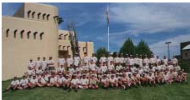
Philmont 2000 Contingent at Koshare Kiva

The Trek will leave New Jersey on June 26, 2002 and fly to Colorado where we will spend two-and-a-half days en-route to Philmont ascending Pikes Peak on the Cog Railway, visiting the Air Force Academy, whitewater rafting on the Arkansas River, eating at the Flying W Ranch, and visiting the Koshare Indian Dancers at their Kiva.